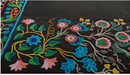
The Flower Beadwork People Parks Canada (click on the Image)

MYBC YOUTH: The Forgotten Ones-Voices of the Métis in BC.